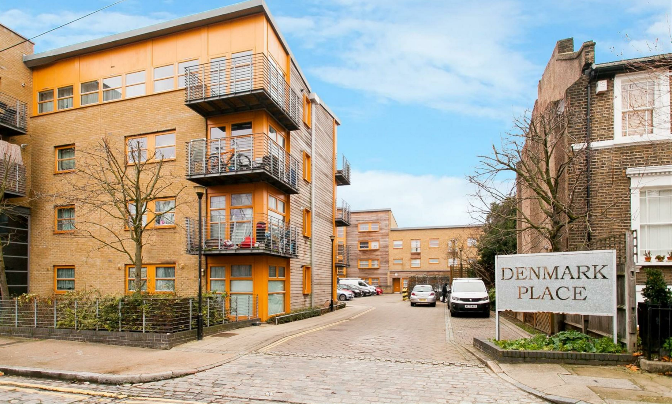
Denmark Place, Bow, E3